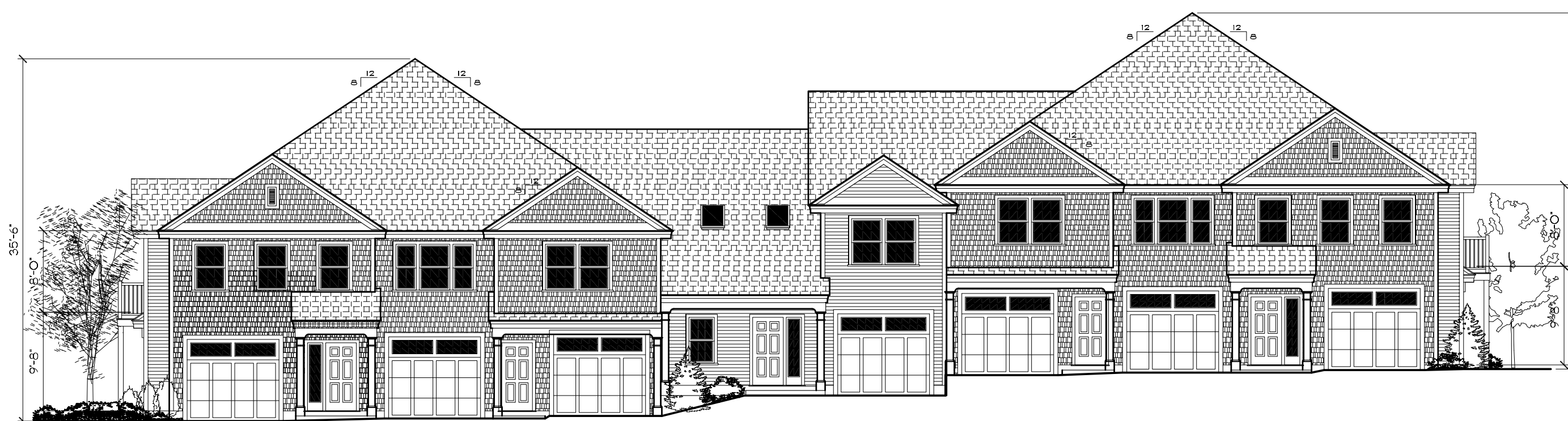
FRONT ELEVATION - BUILDING 4 (7 UNITS)

Village Crossing Billerica, Massachusetts July 21, 2006